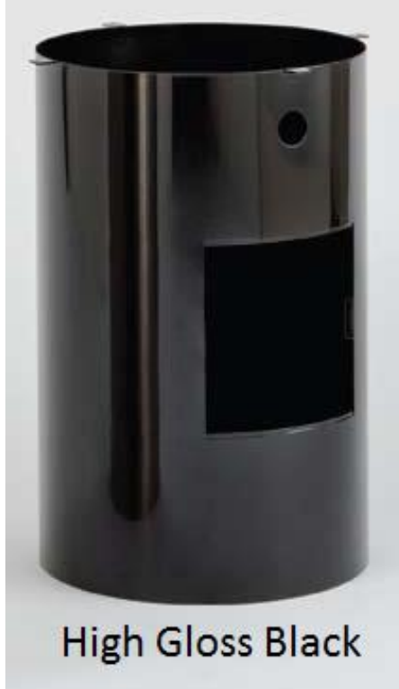
High Gloss Black