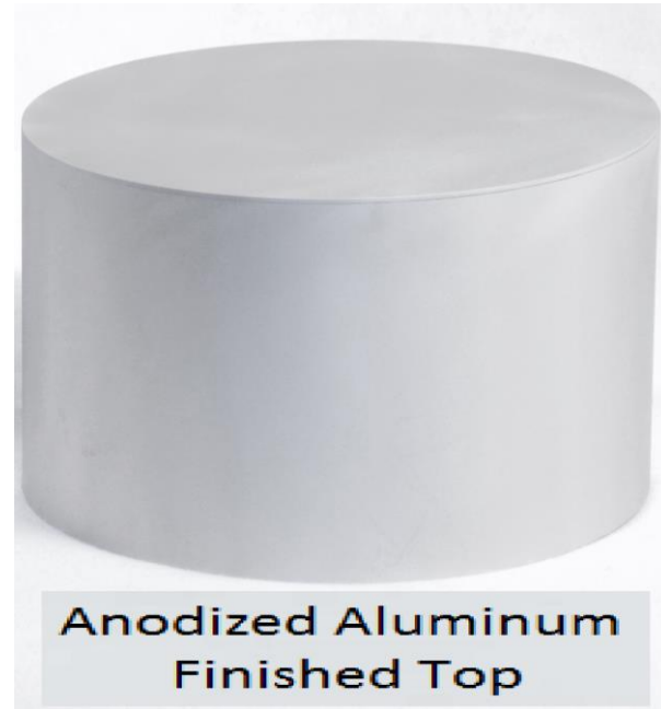
Anodized Aluminum Finished Top