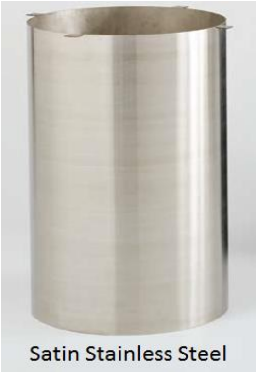
Satin Stainless Steel

FCM RECOMMENDS THAT ALL CYLINDERS ARE BOLTED TO THE FLOOR OR HEAVILY WEIGHTED WHEN SUPPORTING ANY TOP THAT IS NOT BOLTED TO A WALL.